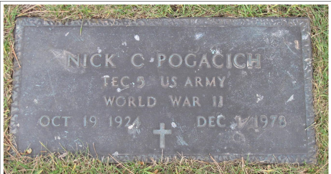
Pogacich Nick 42' s14e42