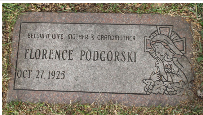
Podgorski Florence 6w 248.5'e w6 s103e29.5